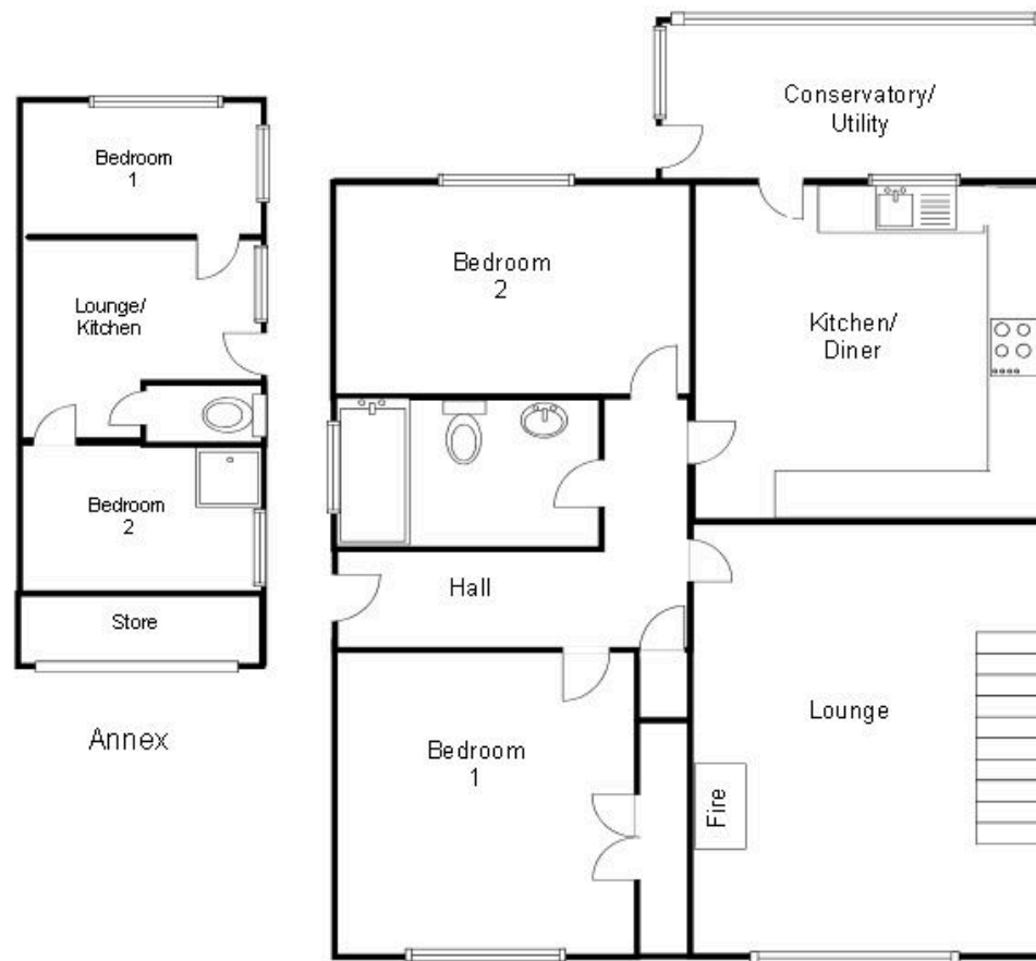
Ground Floor For illustrative purposes only, not to scale.