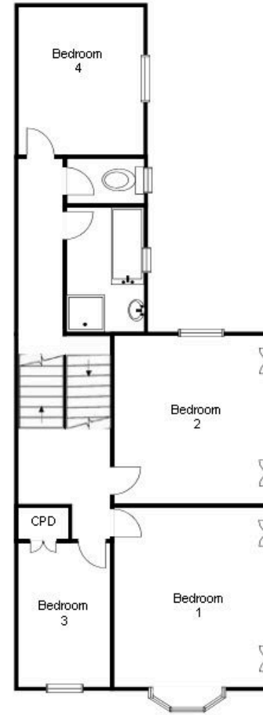
First Floor For illustrative purposes only, not to scale.