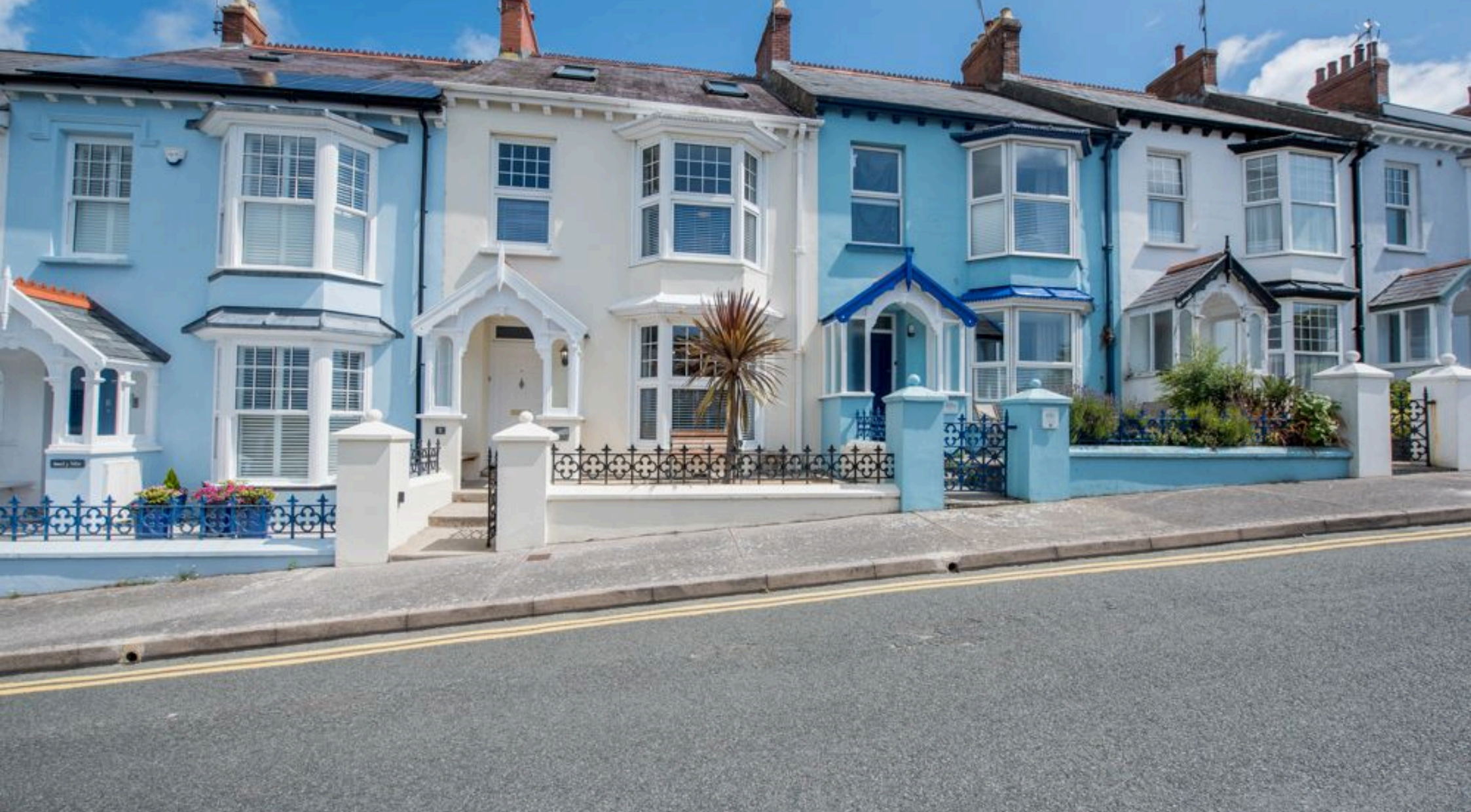
The Briary, 5 Queens Parade, Tenby