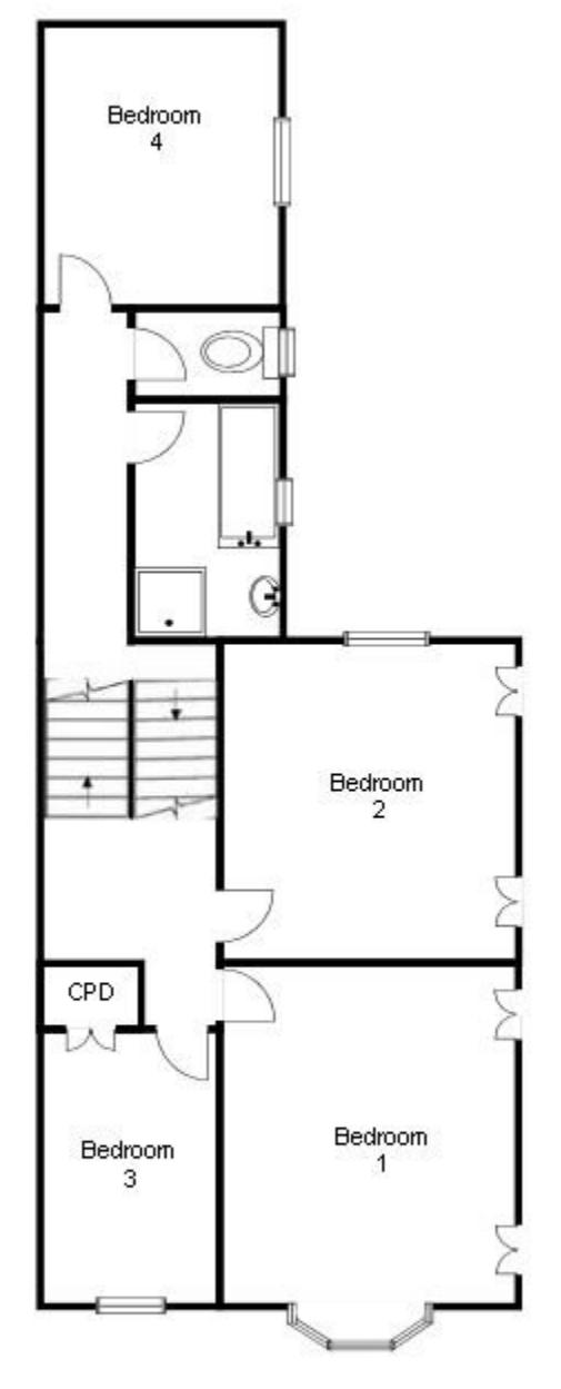
First Floor For Illustrative purposes only, not to scale.

Registered Office: Boston House • Upper Frog Street • Tenby • Pembrokeshire • SA70 7JG Tel: 01834 849090 • Email: info@chandlerrogers.co.uk