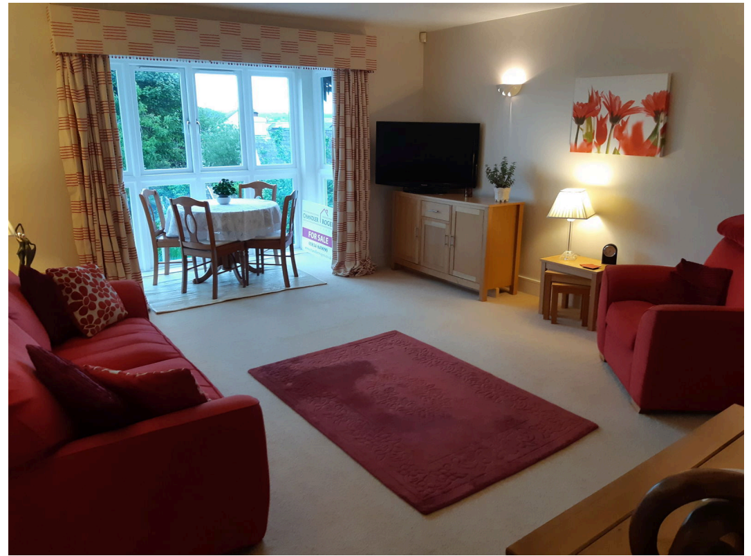
21 Rhodewood House, St Bride's Hill, Saundersfoot