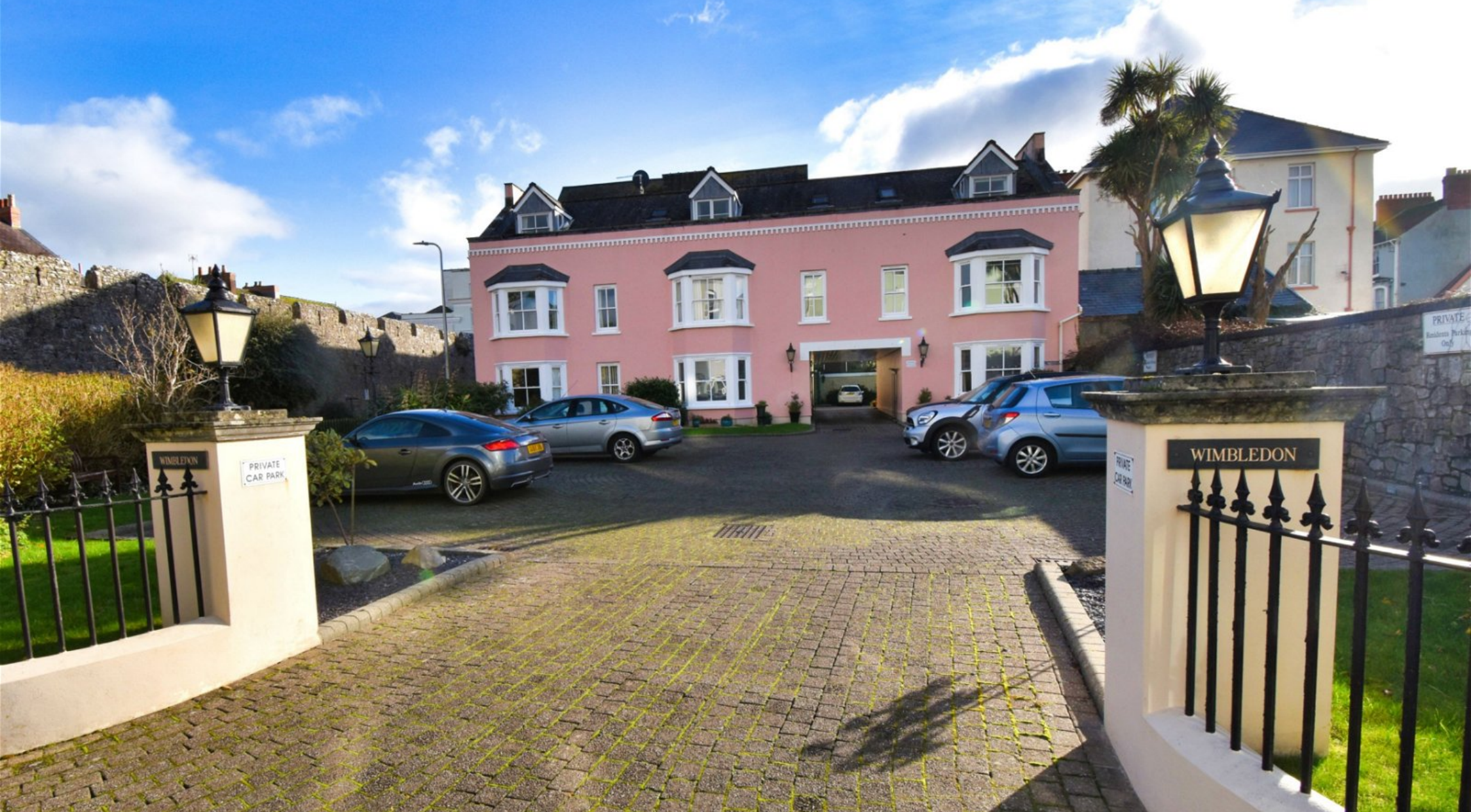
Flat 11, Wimbledon Court, Tenby