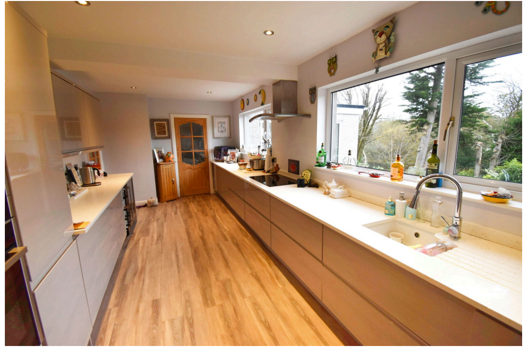
24 Lady Park, Tenby