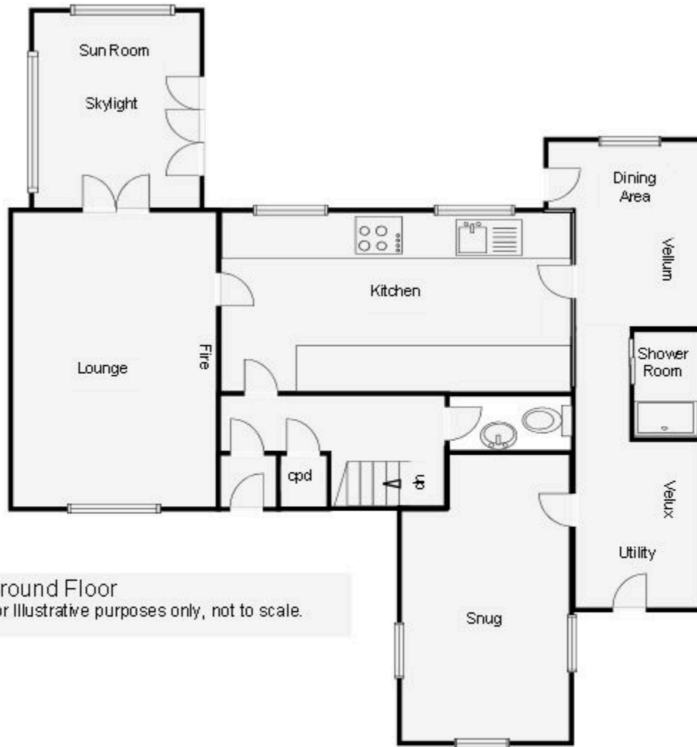
Ground Floor For illustrative purposes only, not to scale.