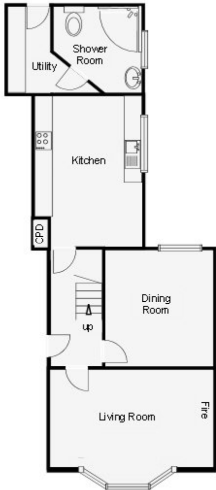
Ground Floor For illustrative purposes only, not to scale.