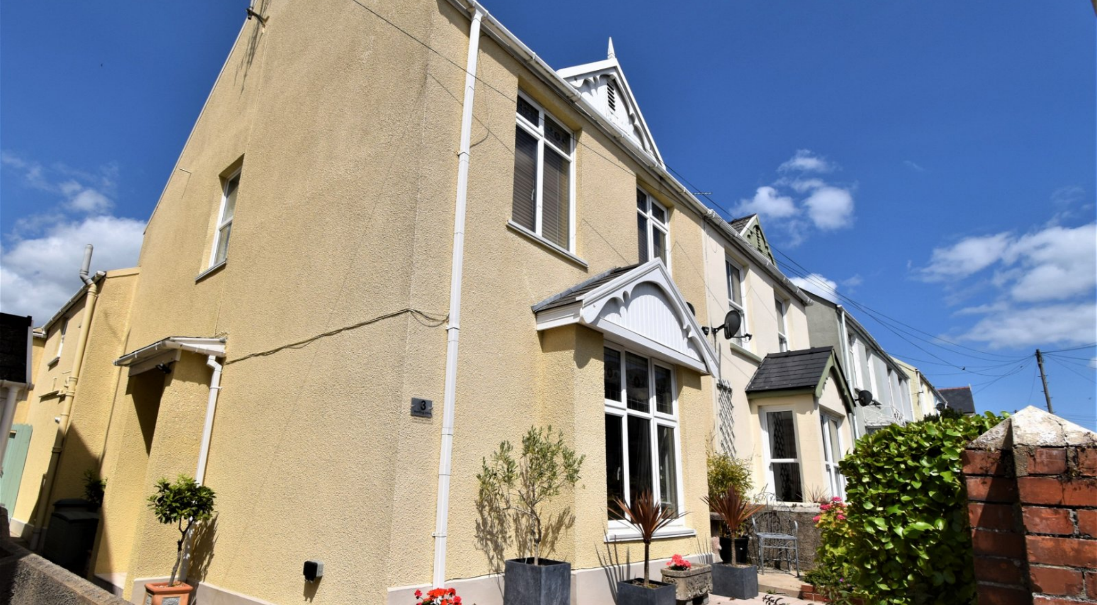
Lawrenny, 3 Harding Villas, Tenby