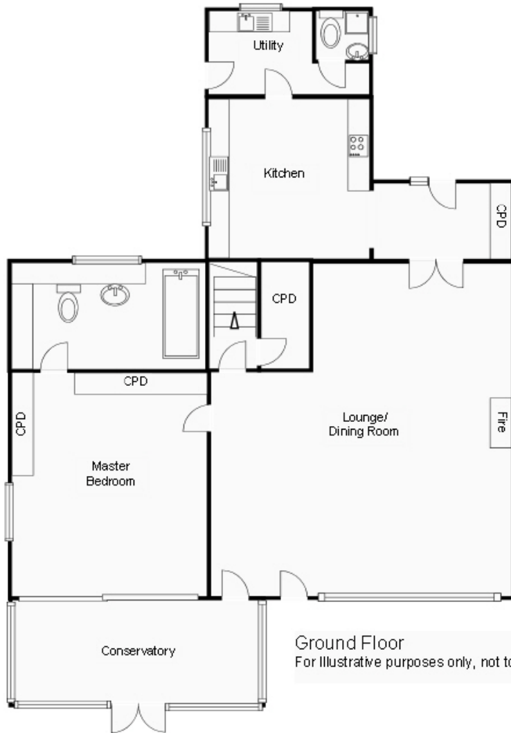
Ground Floor For illustrative purposes only, not to scale.