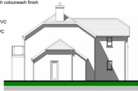
END ELEVATION (East)