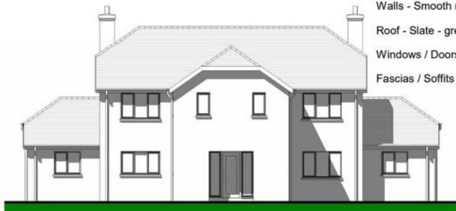
REAR ELEVATION (North)