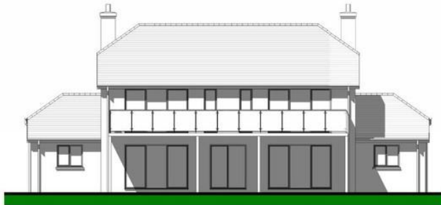
PRINCIPAL FRONT ELEVATION (South)