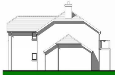
END ELEVATION (West)