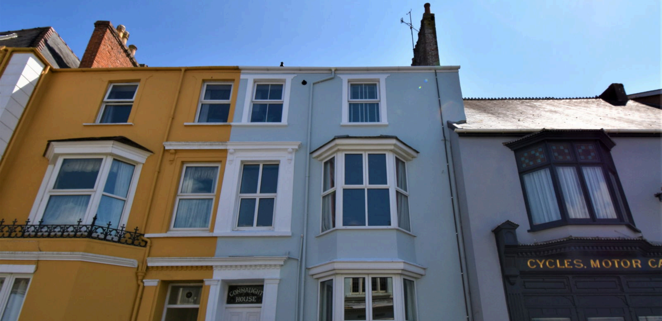
2 Connaught House, Warren St Tenby