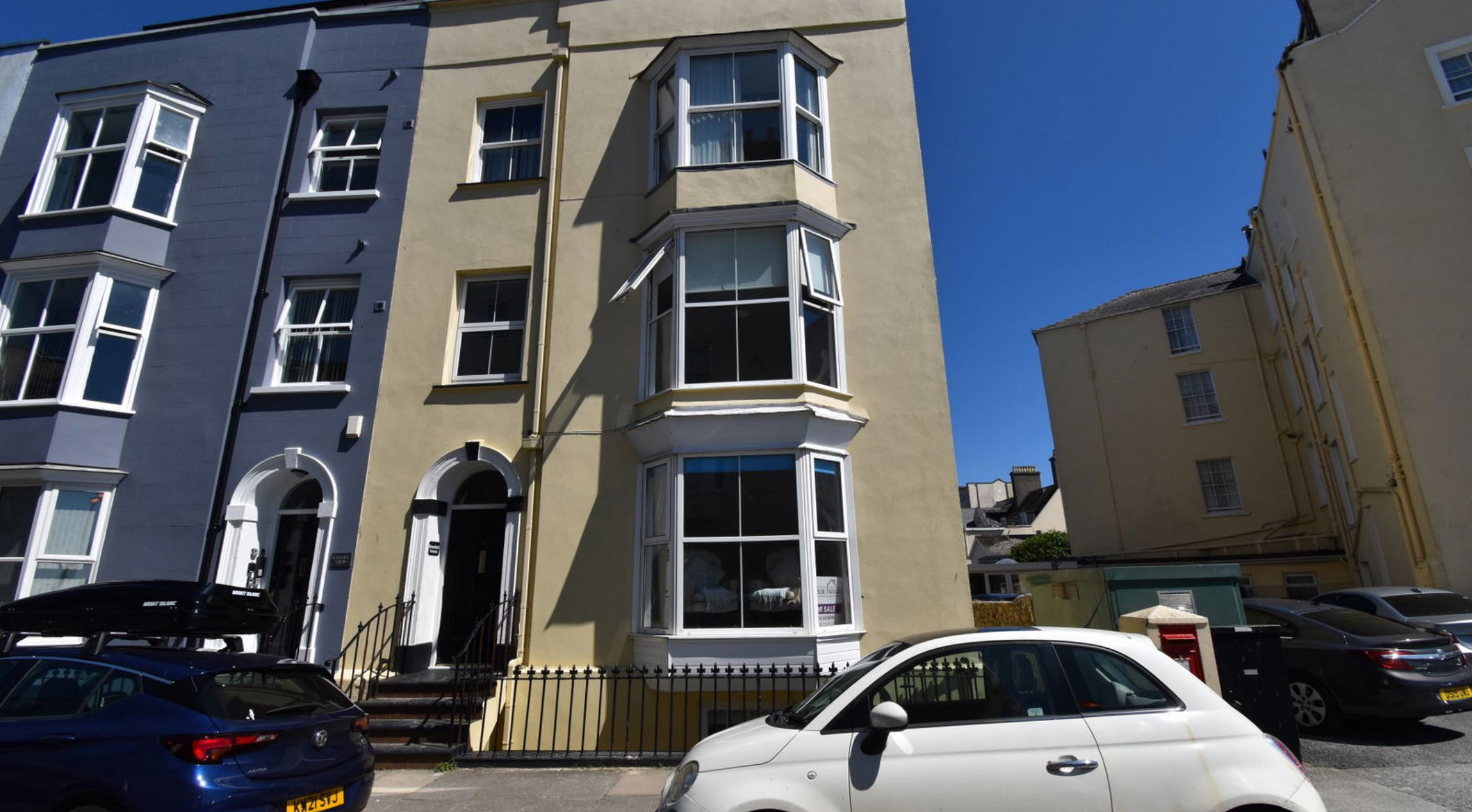
Flat 2 Beaufort House, 38 Victoria Street