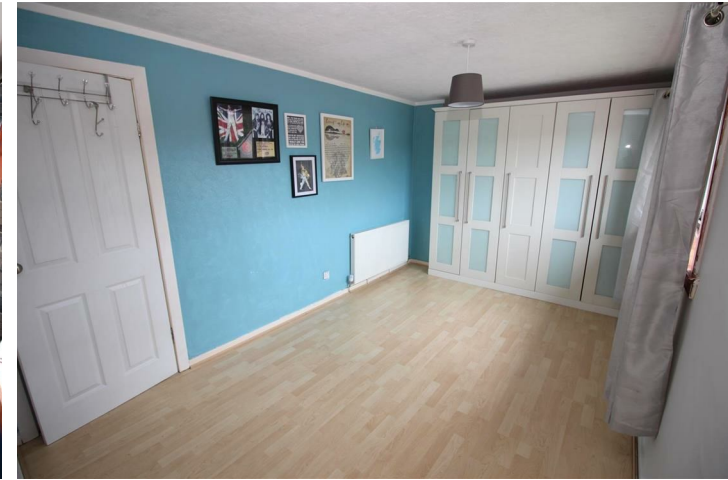
Bedroom 2 11'8" x 9'4" (3.56 x 2.85)