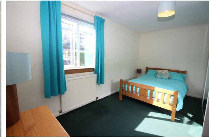
Bedroom 2 11'4" x 10'7" (3.46m x 3.25m)