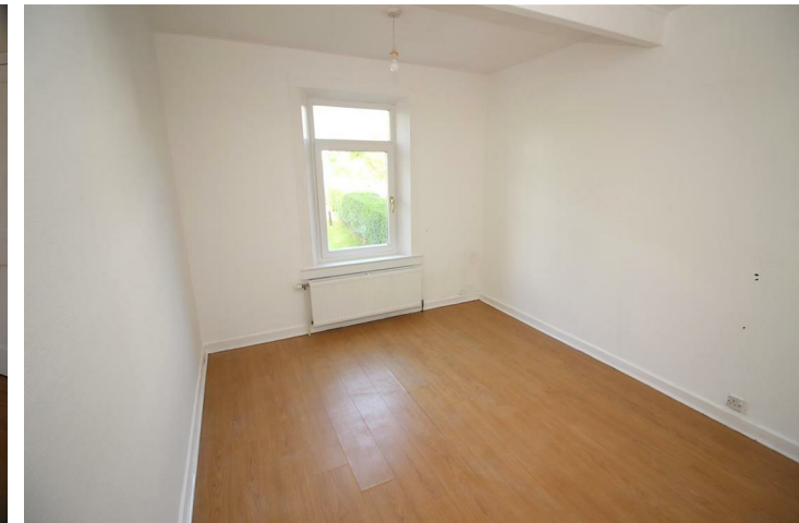
Bedroom 2 10'11" x 12'10" (3.33m x 3.92m)