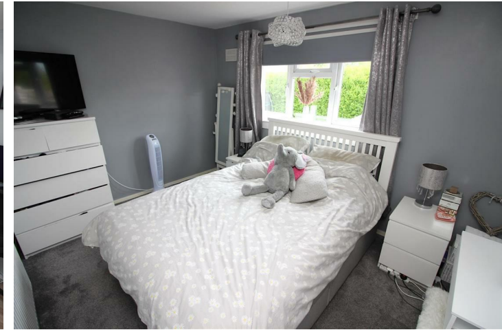
Bedroom 2 12'3" x 9'0" (3.75m x 2.76m)