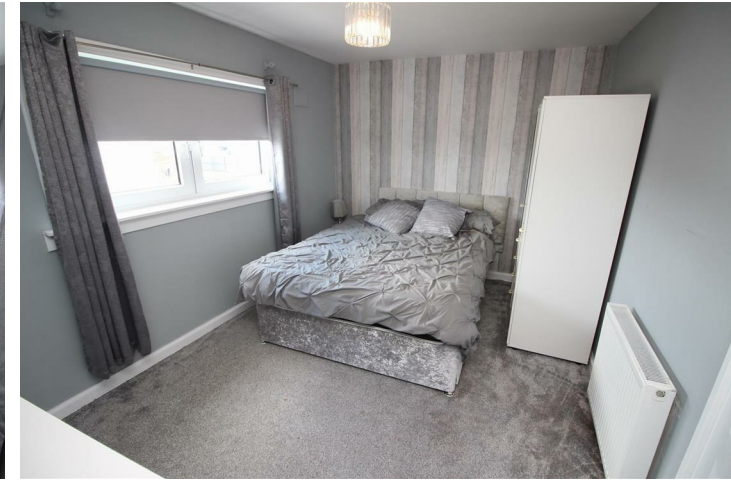
Bedroom 2 12'6" x 9'4" (3.83 x 2.85)