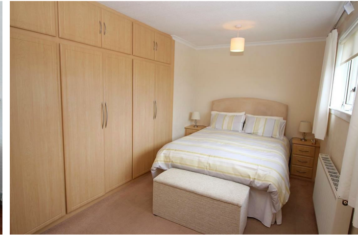
Bedroom 2 13'4" x 9'5" (4.08 x 2.88)