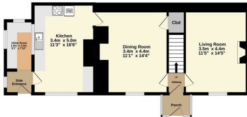
Ground floor 61.8 sq.m. (665 sq.ft.) approx.