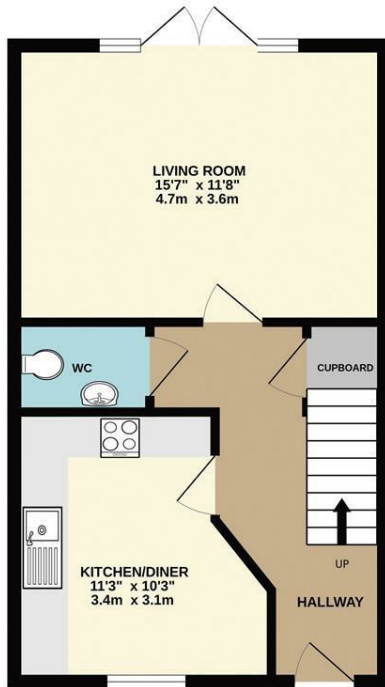
GROUND FLOOR 417 sq.ft. (38.8 sq.m.) approx.