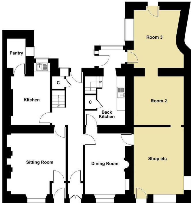
GROUND FLOOR (& Commercial Area)