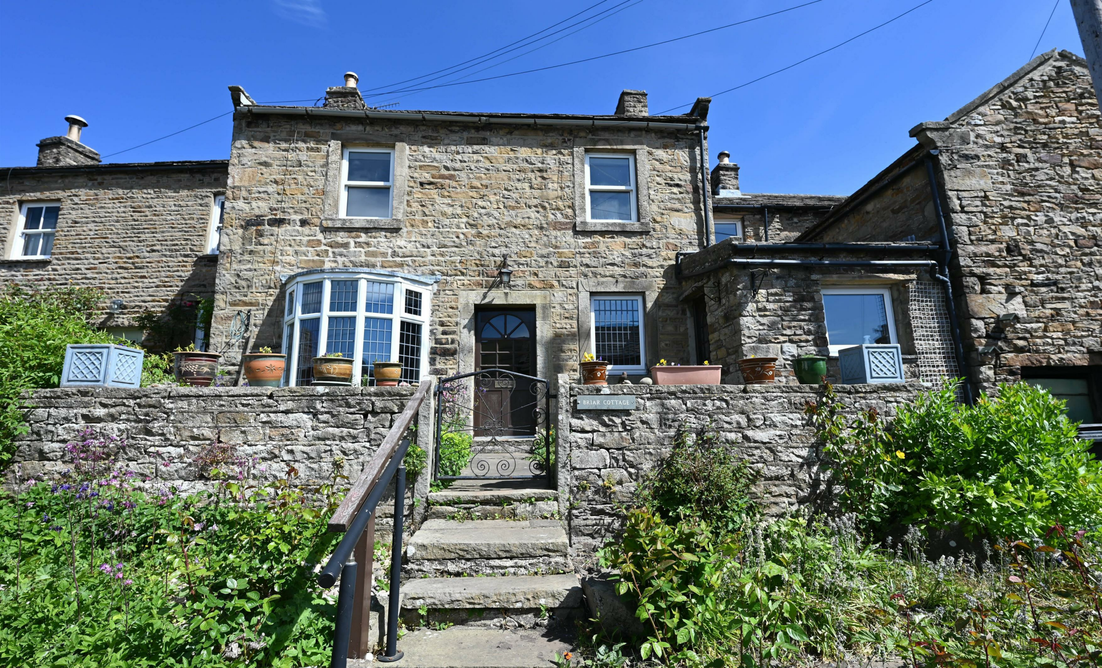
Briar Cottage Gunnerside, Richmond, DL11 6LA Offers over £275,000