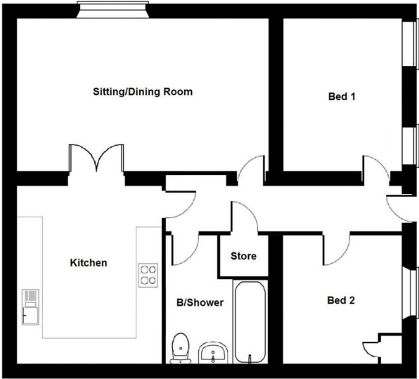
Sketch Plan for Identification Purposes Only The placement & size of walls, doors, windows, staircases & fixtures are approximate & cannot be relied upon as other than for guidance purposes only