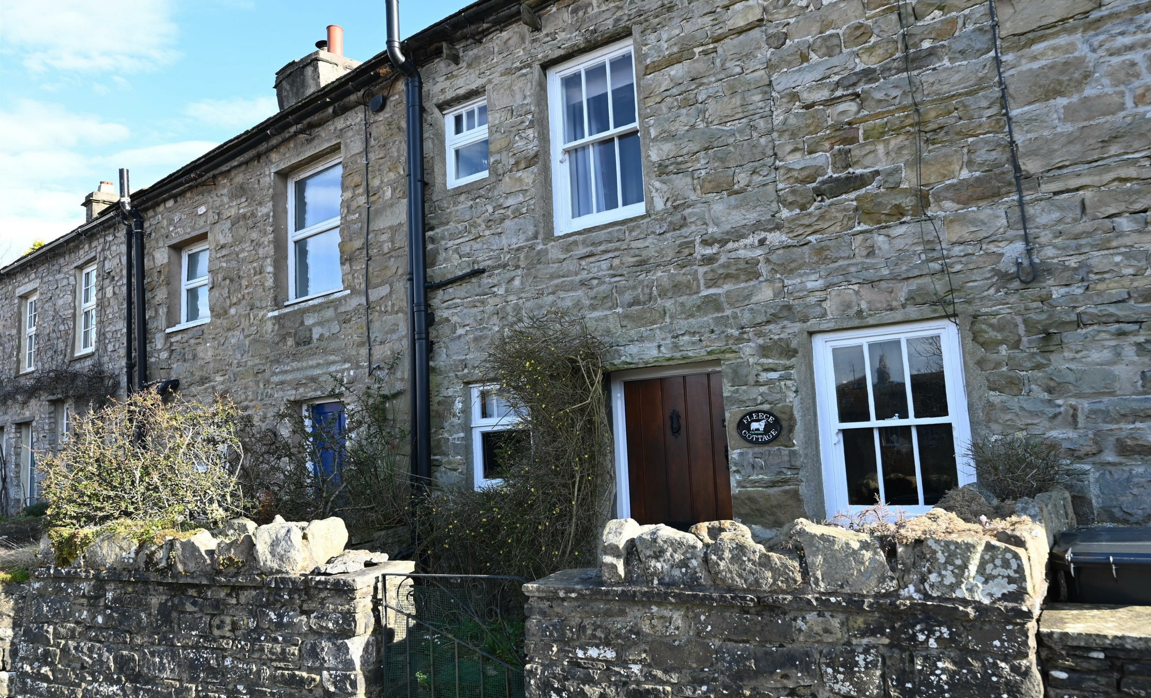
Fleece Cottage Beckstones, Gayle, Hawes, DL8 3SA £234,950