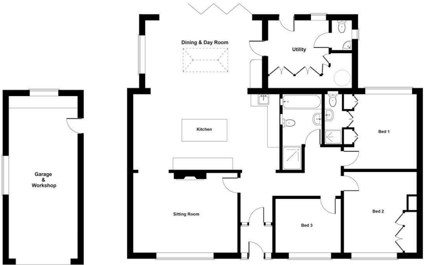
SKETCH PLAN FOR ILLUSTRATIVE PURPOSES ONLY All measurements walls, doors, windows, fittings and appliances, their sizes and locations, are approximate only. They cannot be regarded as being a representation by the seller, nor their agent. Produced by Potterplans Ltd. 2024