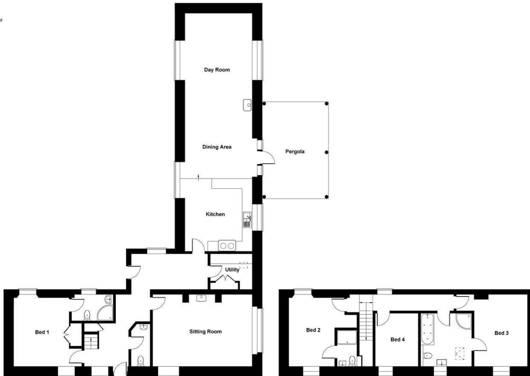
OAK LODGE Ground Floor