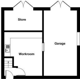
OUTBUILDING Ground Floor