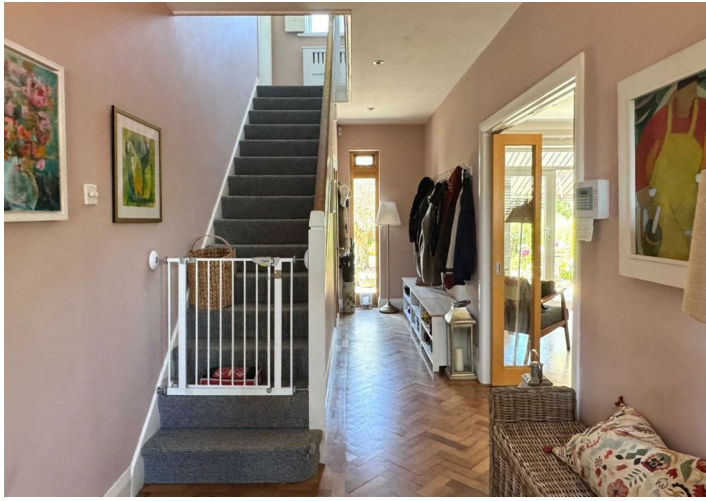
141 Plymouth Road