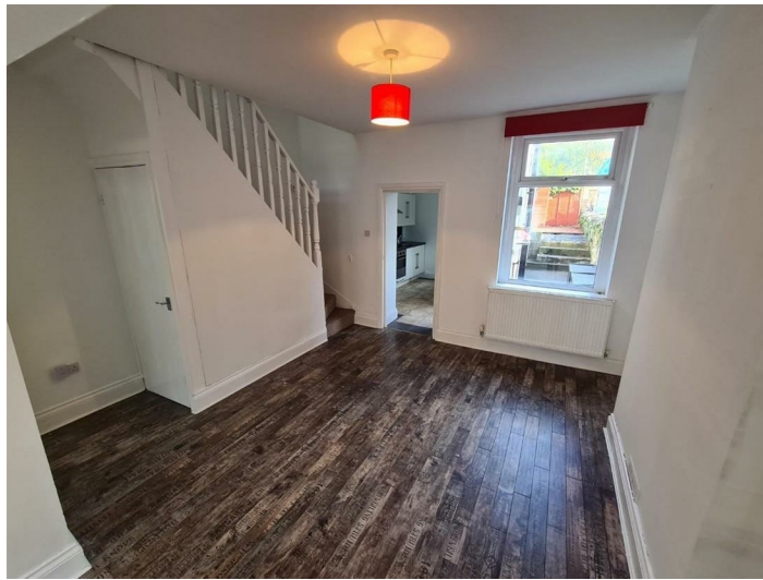
Entrance Hall Wood effect flooring, radiator.

Living/Dining Room 22'8" x 10'1" (6.91m x 3.09m) Window to front and rear, radiators. Wood effect flooring, understairs storage.