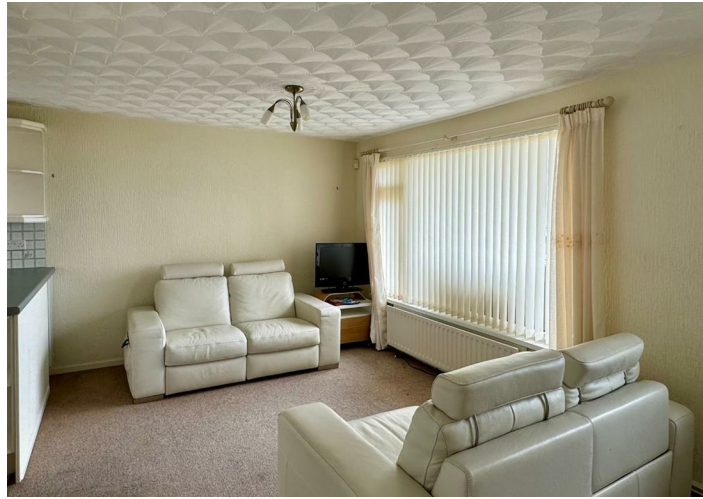
Front door to open plan lounge/dining/kitchen.