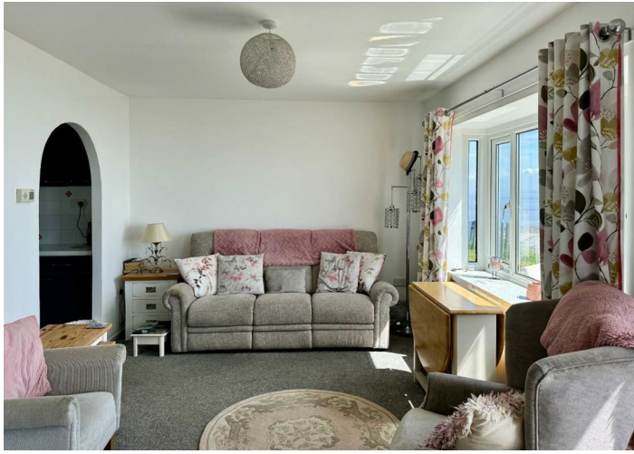
Front door to open plan lounge/dining.