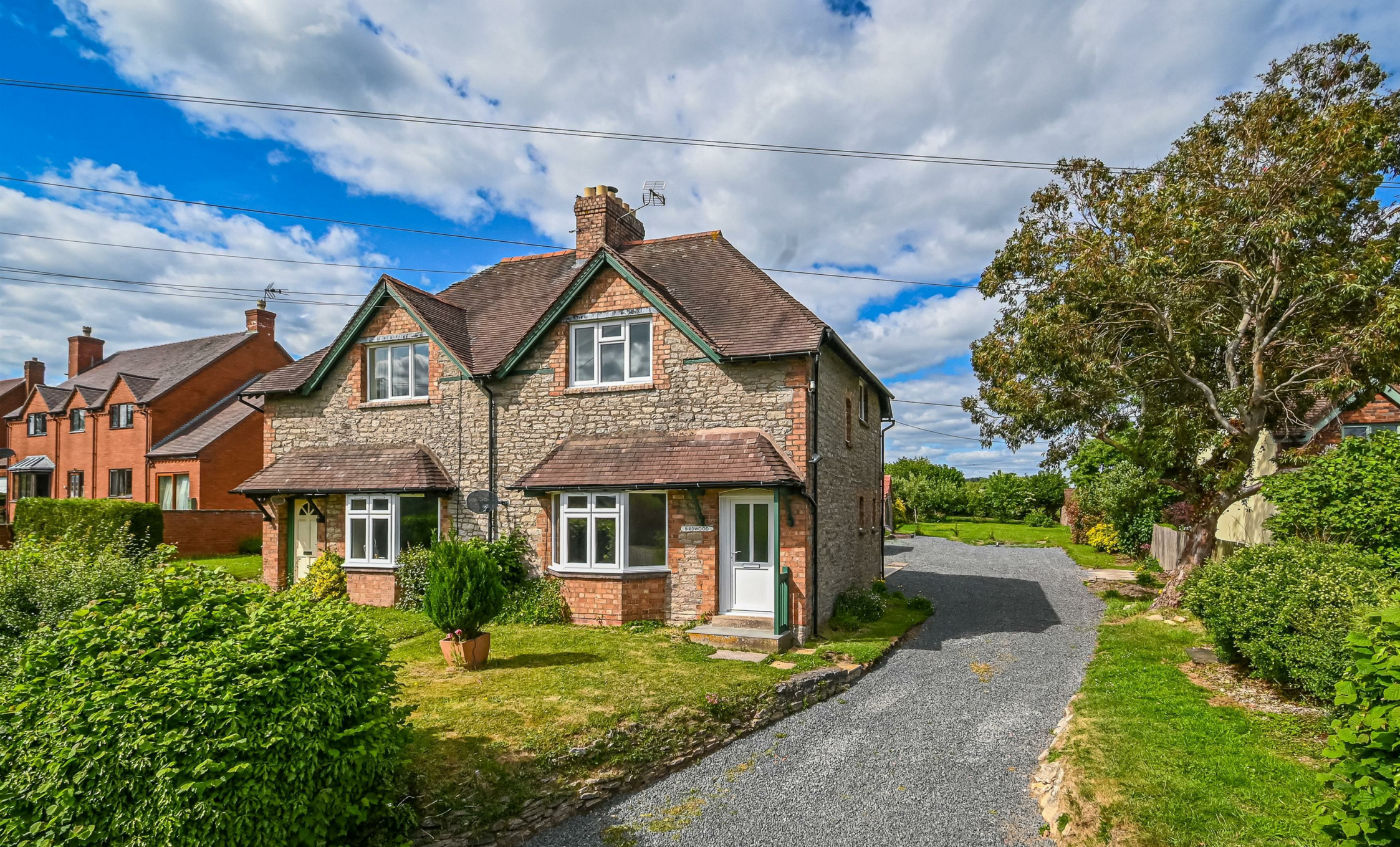
Birdwood Easthope, Much Wenlock, Shropshire, TF13 6DN