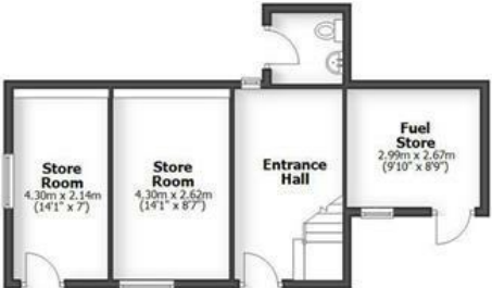
Outbuildings Ground Floor