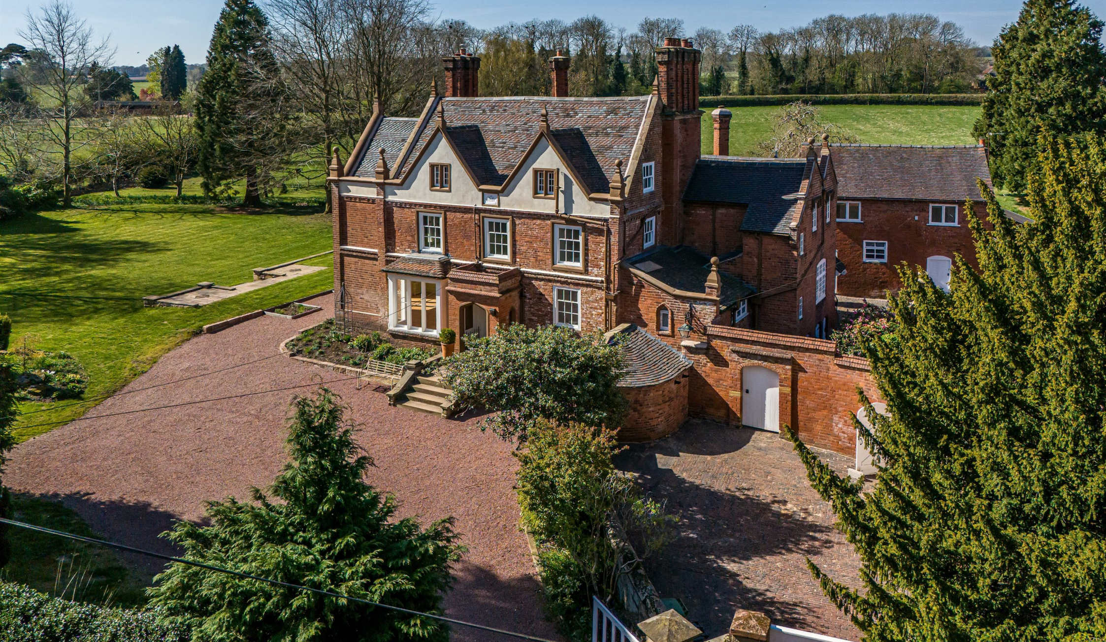
Old Manor House, Seisdon Road, Seisdon, Wolverhampton, South Staffordshire, WV5 7ER