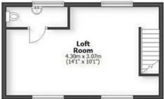
Outbuildings First Floor