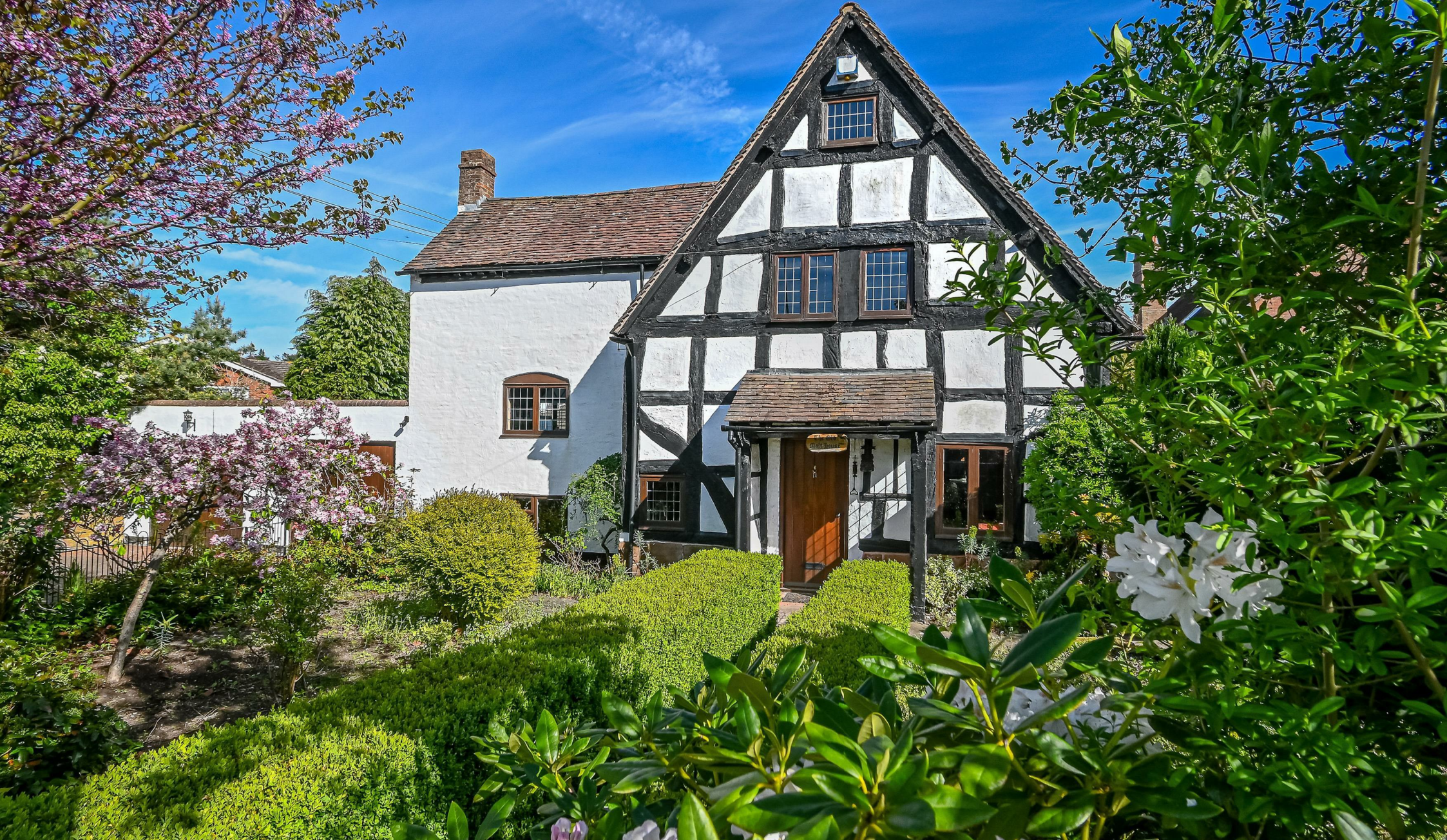
The Old Malthouse, Hilton, Bridgnorth, Shropshire, WV15 5PJ