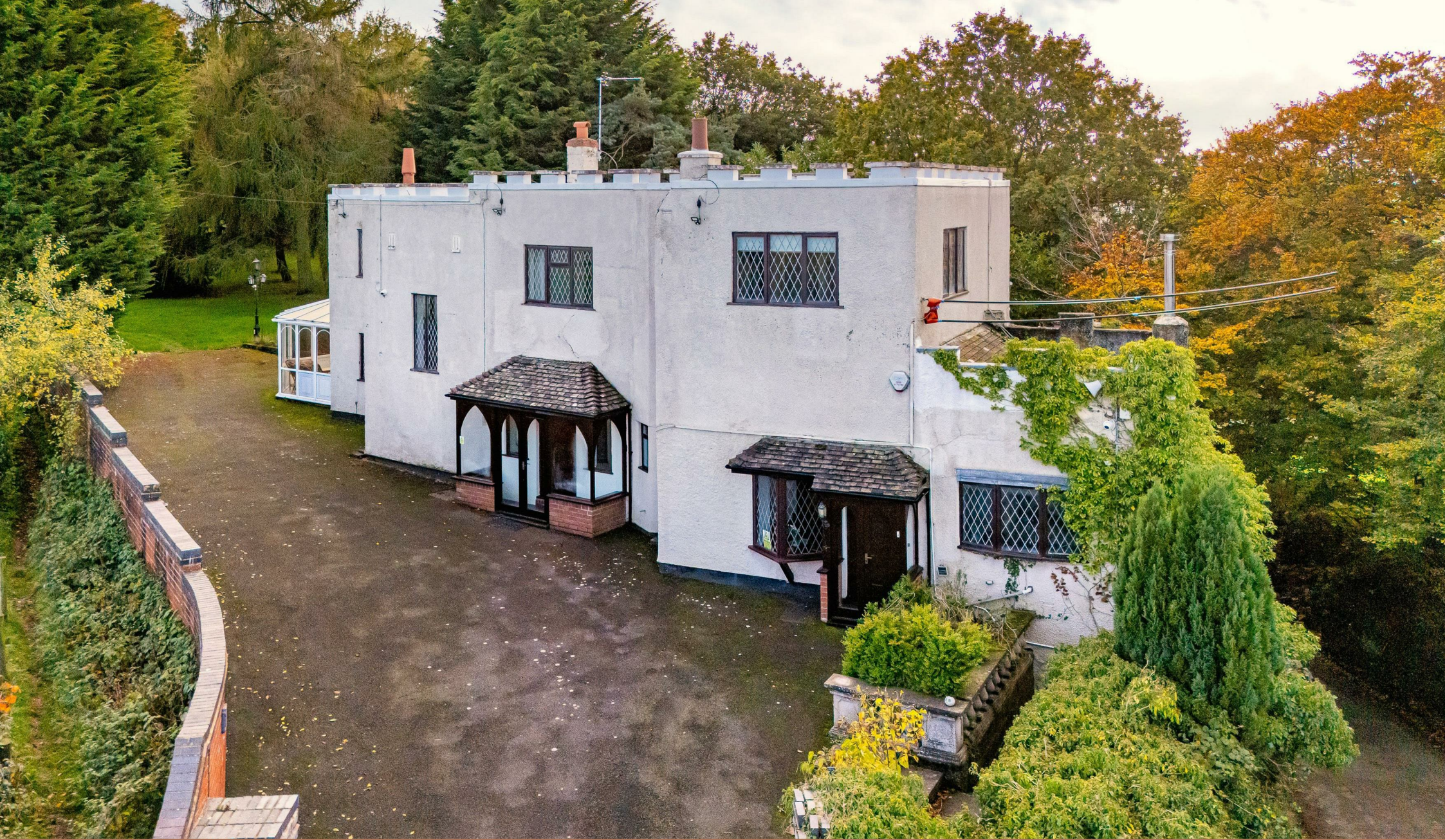
Tinkers Castle, Tinkers Castle Road, Seisdon, Wolverhampton, South Staffordshire, WV5 7HF