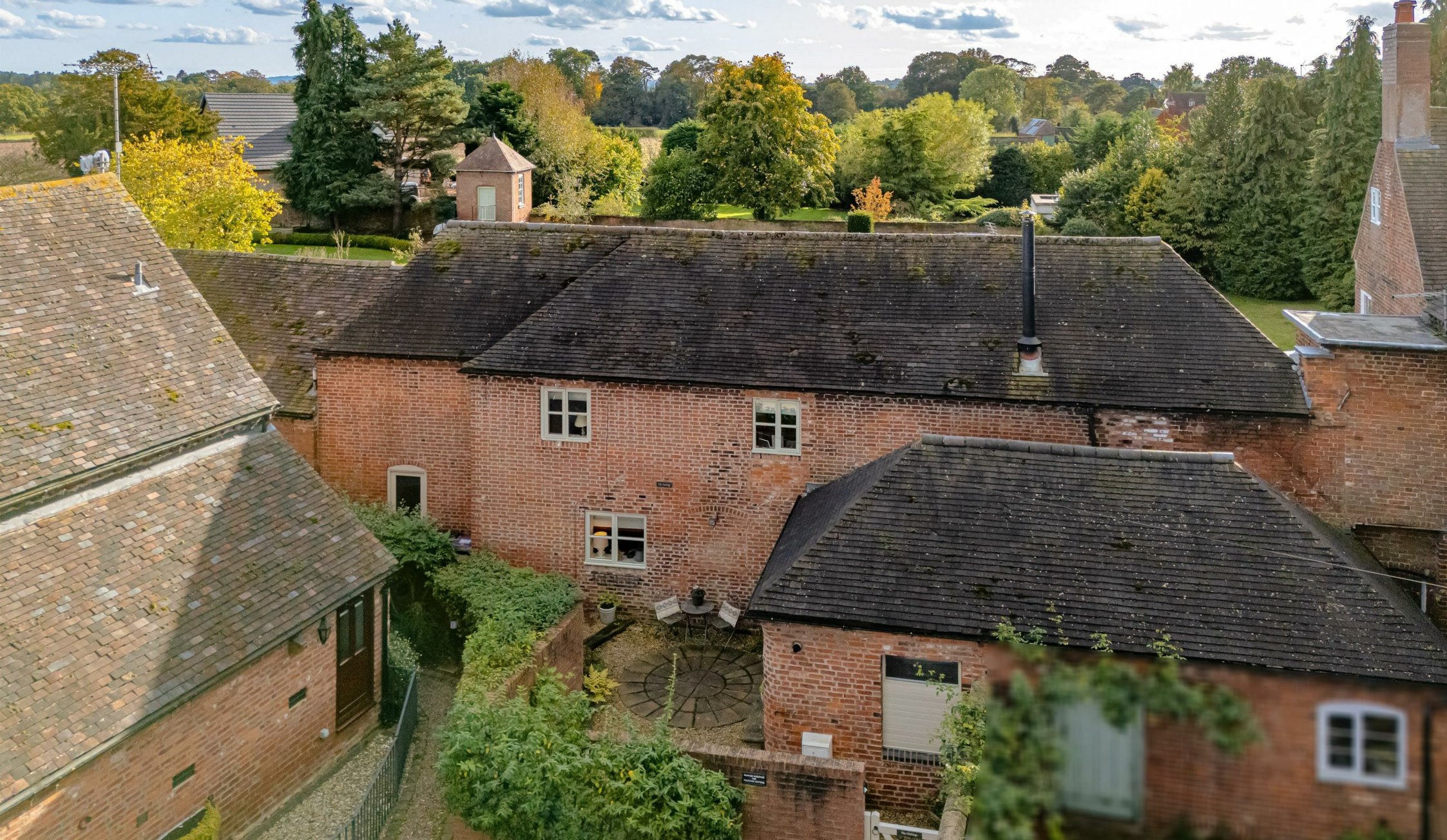
The Maltings, Chesterton, Bridgnorth, Shropshire, WV15 5NX