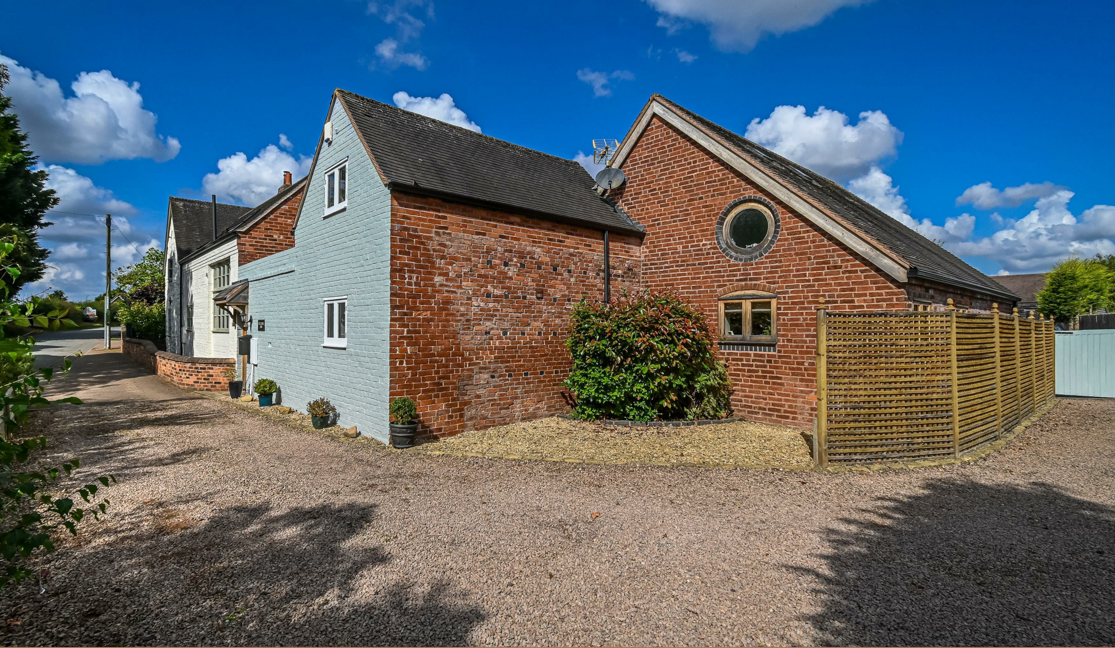
Bulls Bank Barn, Ashford Bank, Claverley, Wolverhampton, Shropshire, WV5 7DY