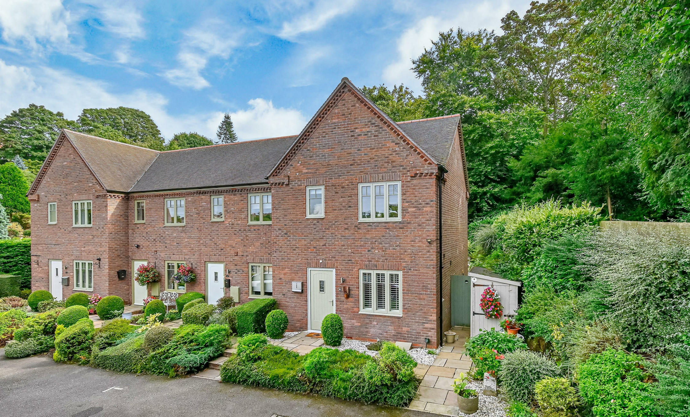
4 The Dairy, Stourbridge Road, Bridgnorth, Shropshire, WV15 6AQ