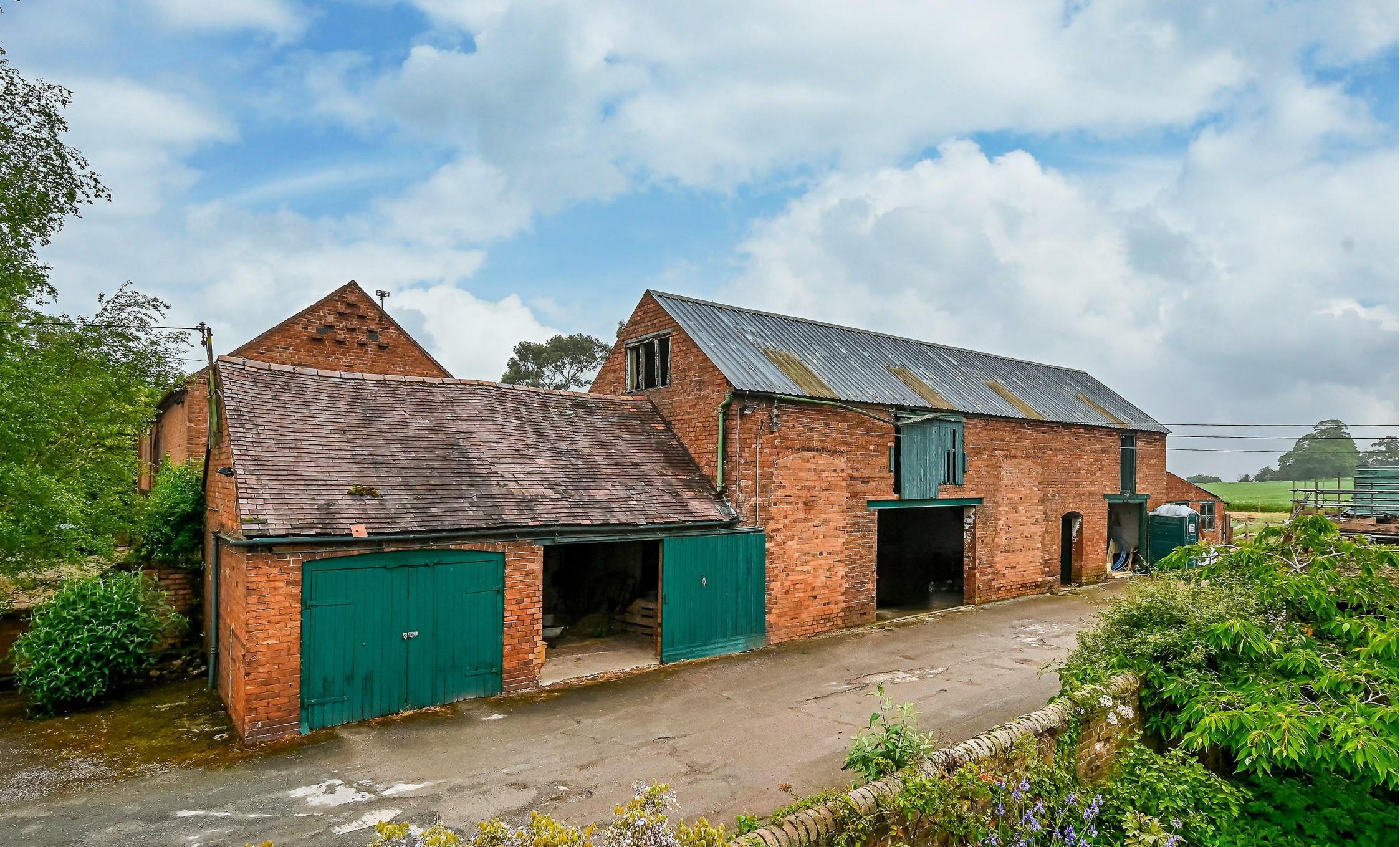
Barn adjacent to Church Farm, Hall Lane, Kemberton, Shifnal, Shropshire, TF11 9LQ