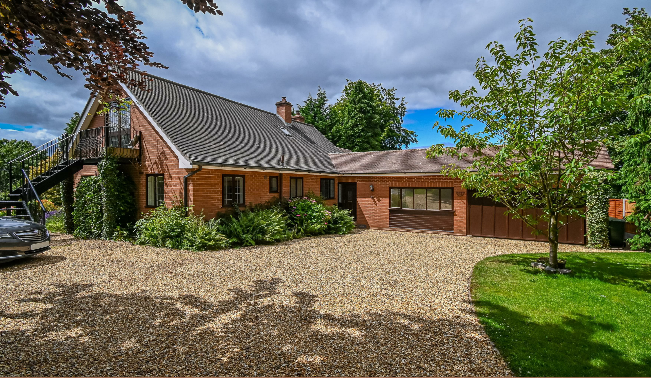
Orchard Bungalow, Hilton, Bridgnorth, Shropshire, WV15 5PB