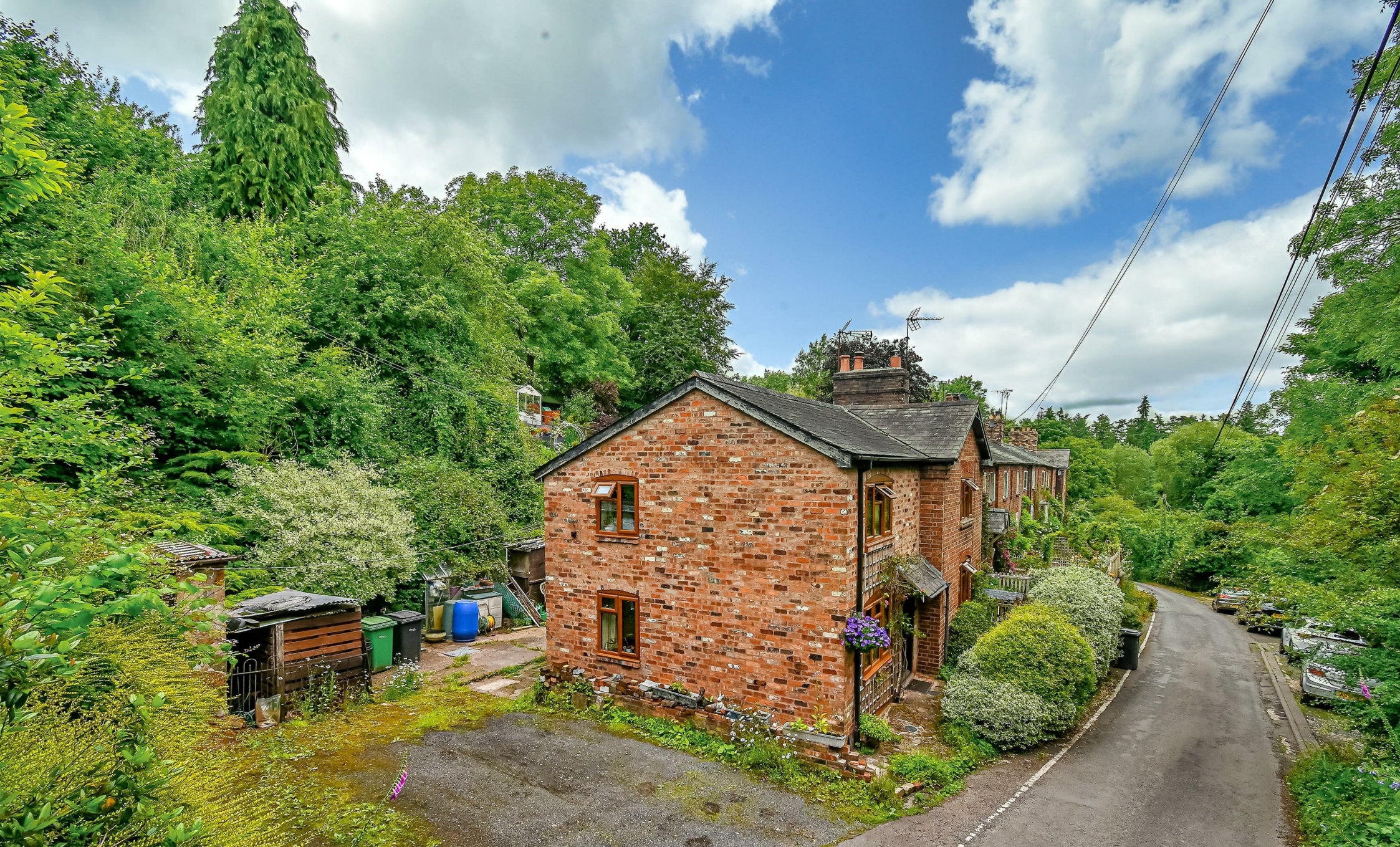
Rose Cottage, 1 Astbury Terrace, Bridgnorth, Shropshire, WV16 6AT