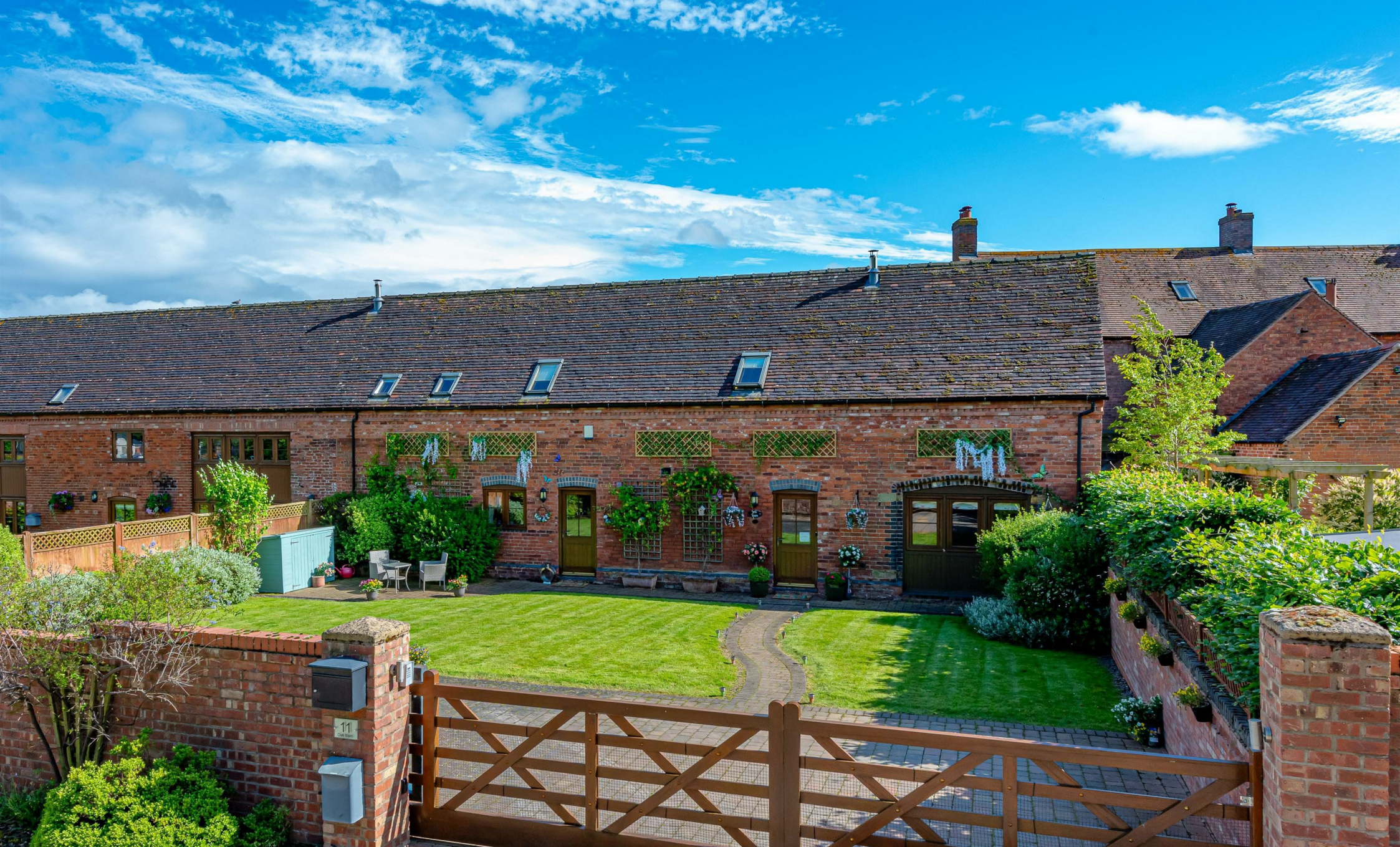
Oak Barn, 11 Cranmoor, Wrottesley Park, Wolverhampton, WV8 2JN