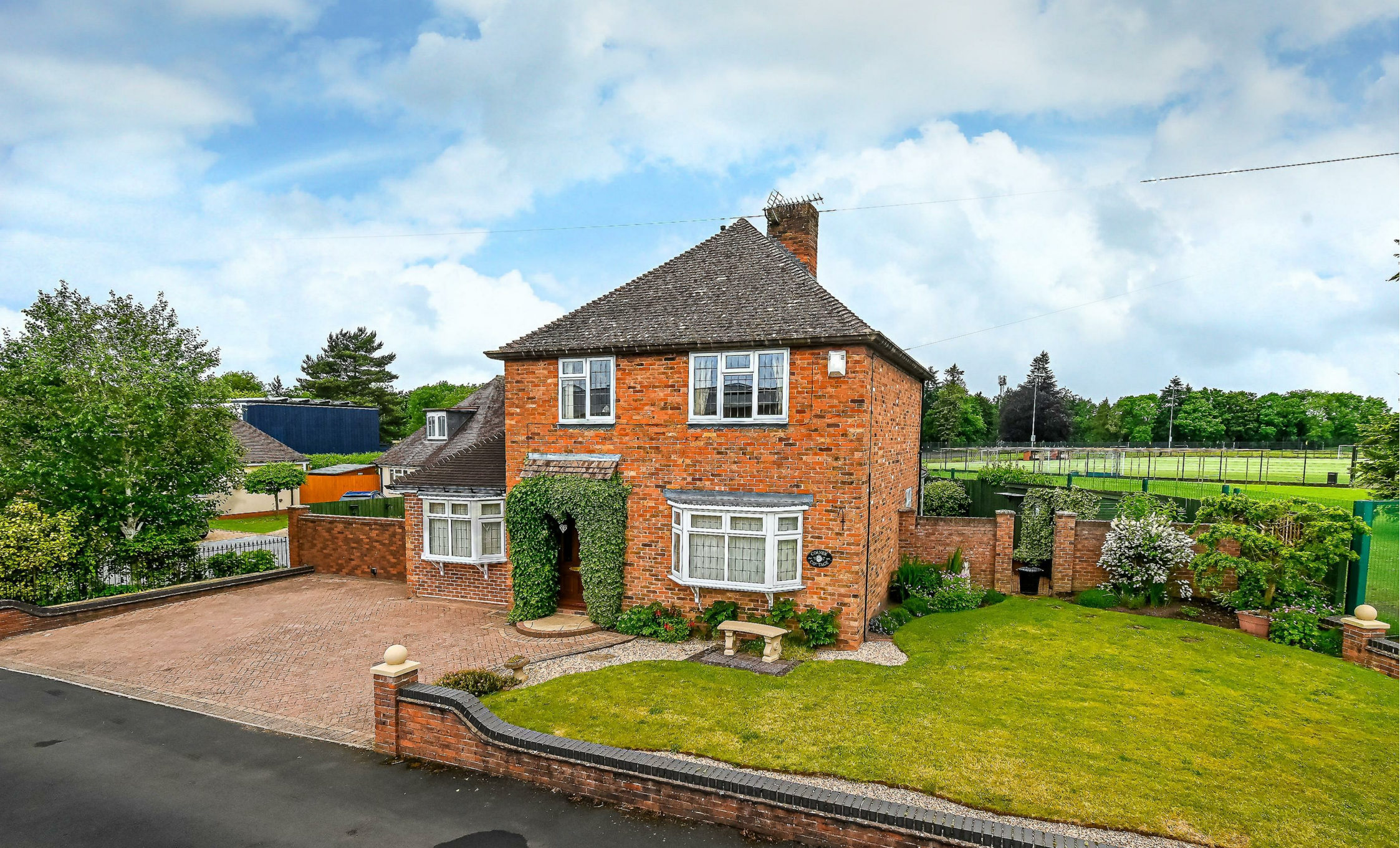
Corner Cottage, Love Lane, Bridgnorth, Shropshire, WV16 4HE