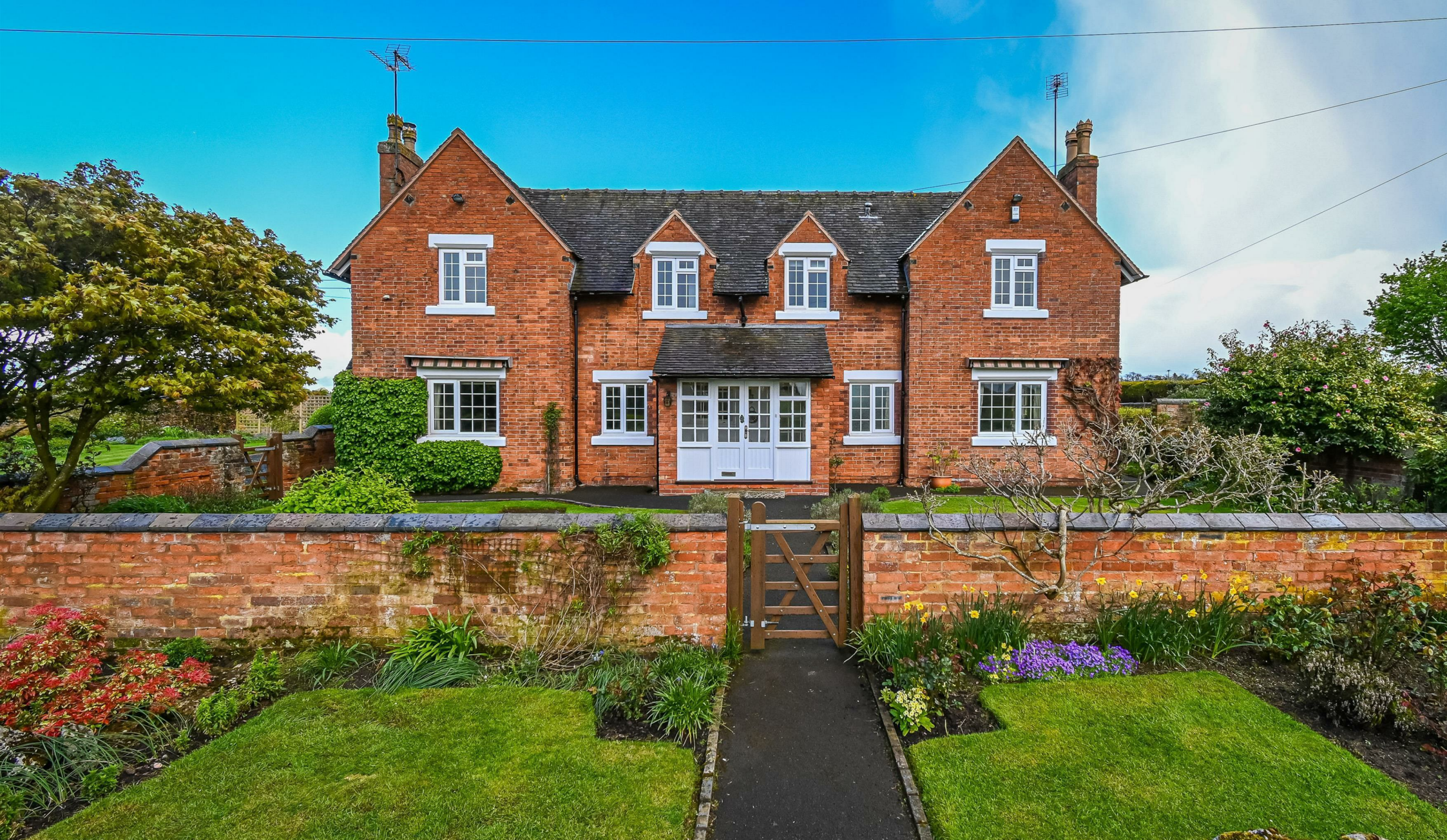
Lower Snowdon Cottage, Snowdon Road, Burnhill Green, Wolverhampton, South Staffordshire, WV6 7HT