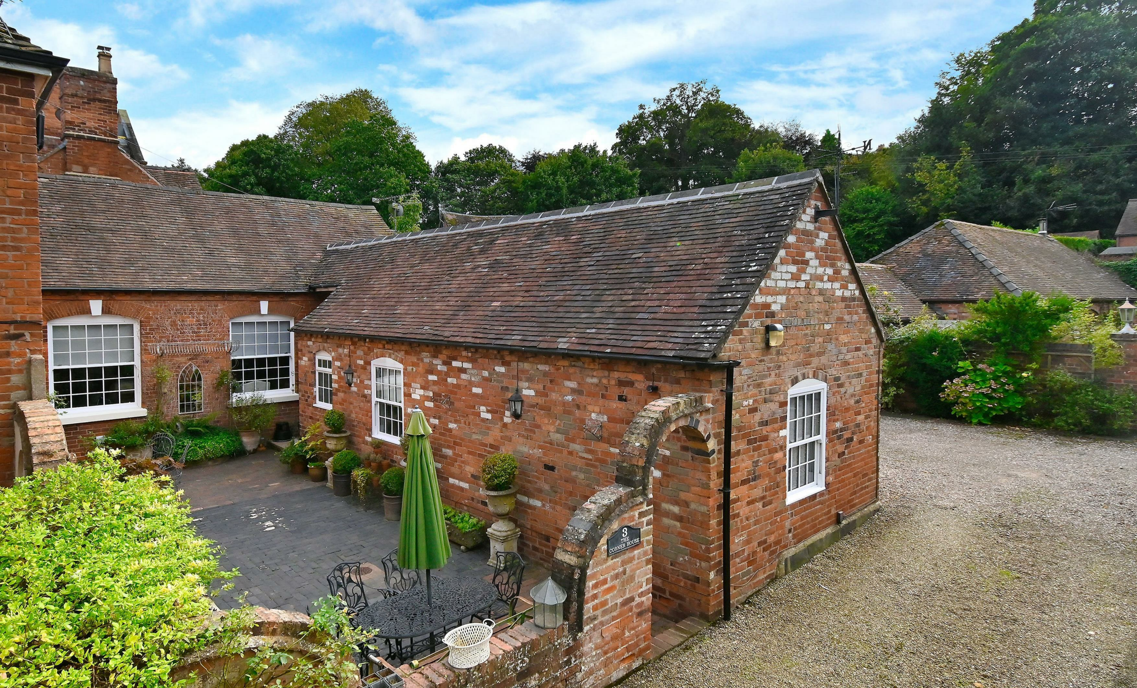
Corner House Stableford, Bridgnorth, WV15 5LS