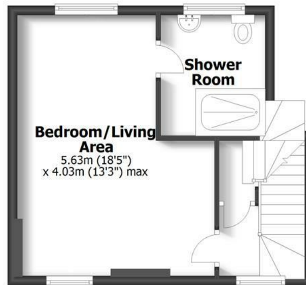
First Floor 'The Bridge'