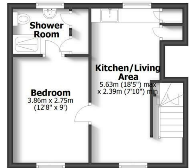
Second Floor 'The Loft'