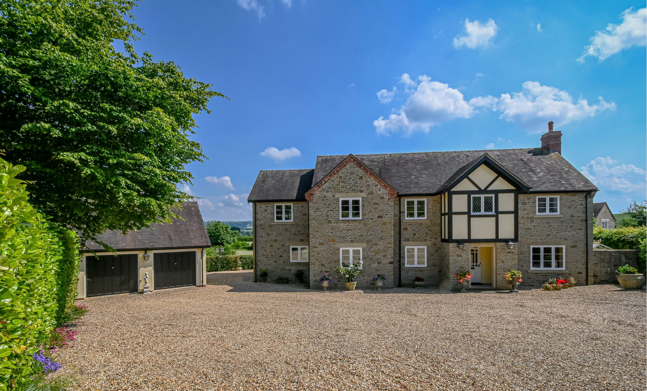
Beech House, Munslow, Shropshire, SY7 9ET