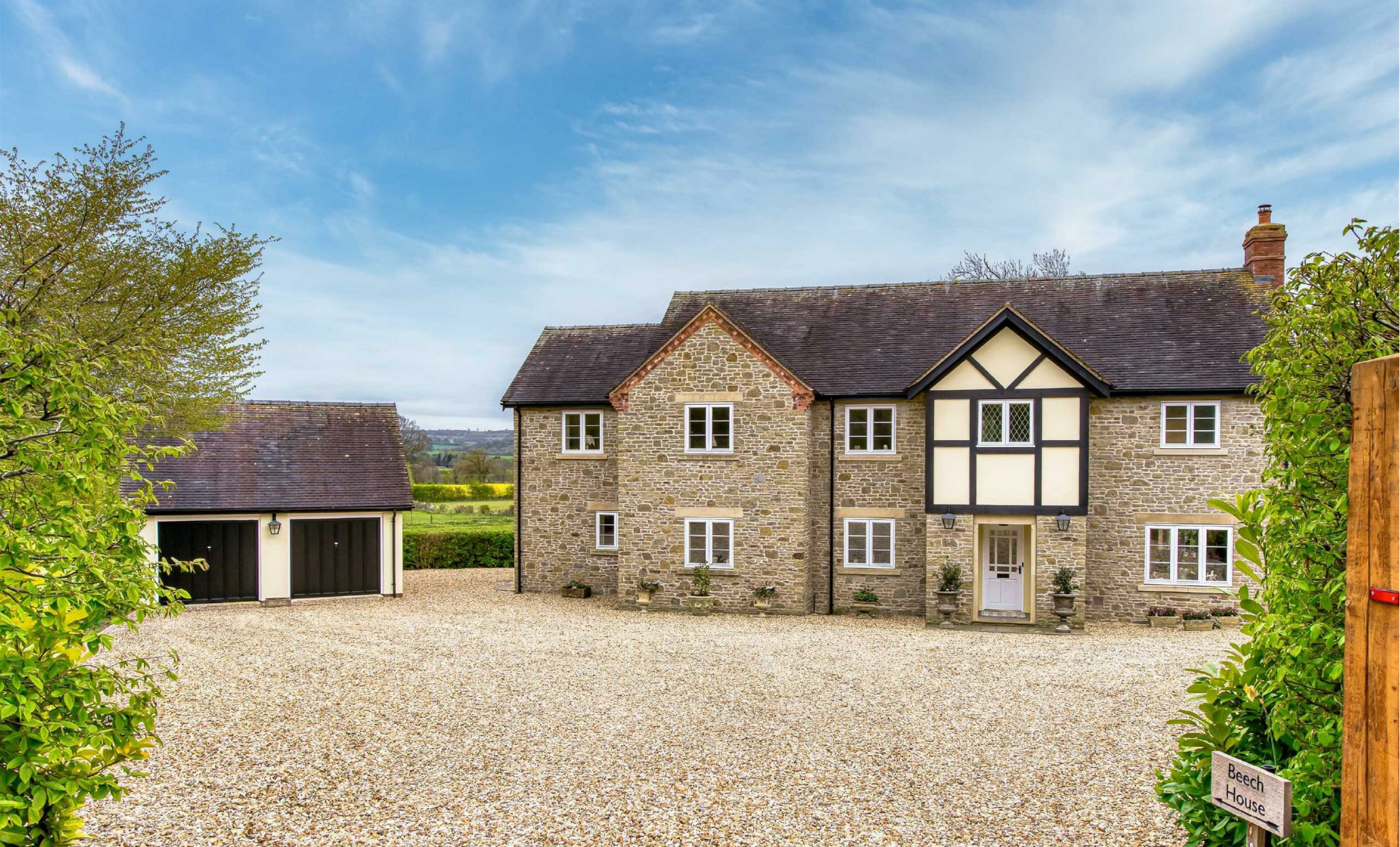
Beech House, Munslow, Shropshire, SY7 9ET