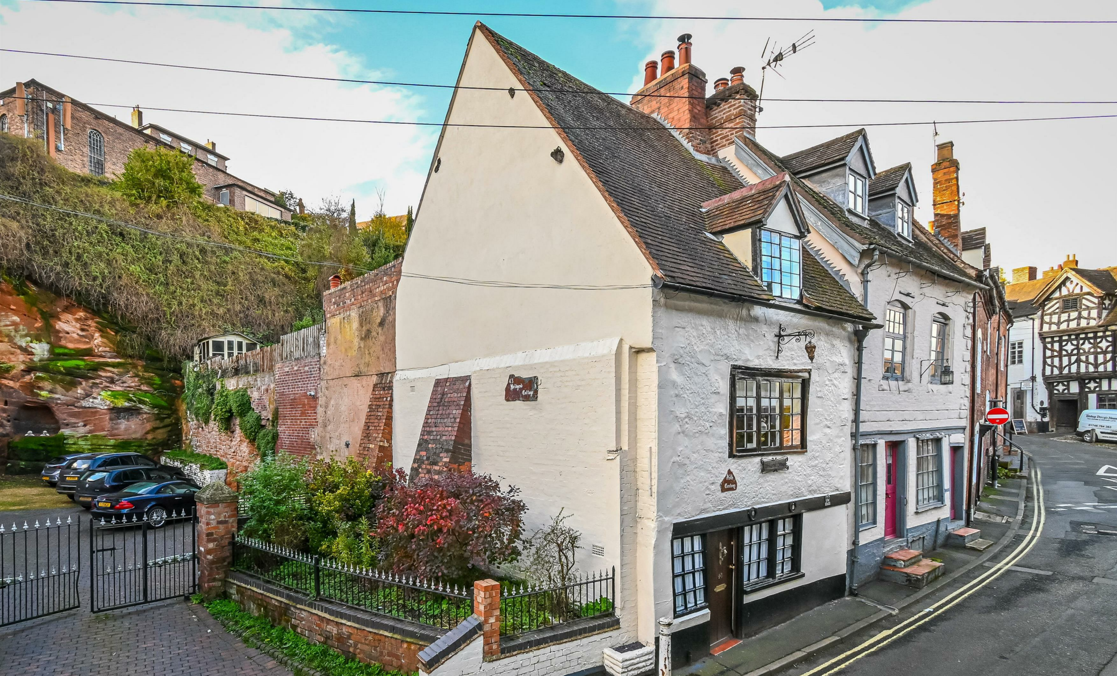
Bridgend Cottage, 43 Cartway, Bridgnorth, Shropshire, WV16 4BG