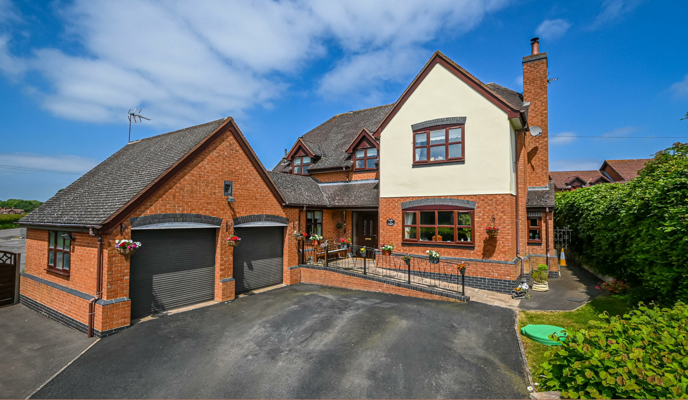
Cape Lodge Bynd Lane, Billingsley, Bridgnorth, Shropshire, WV16 6PG