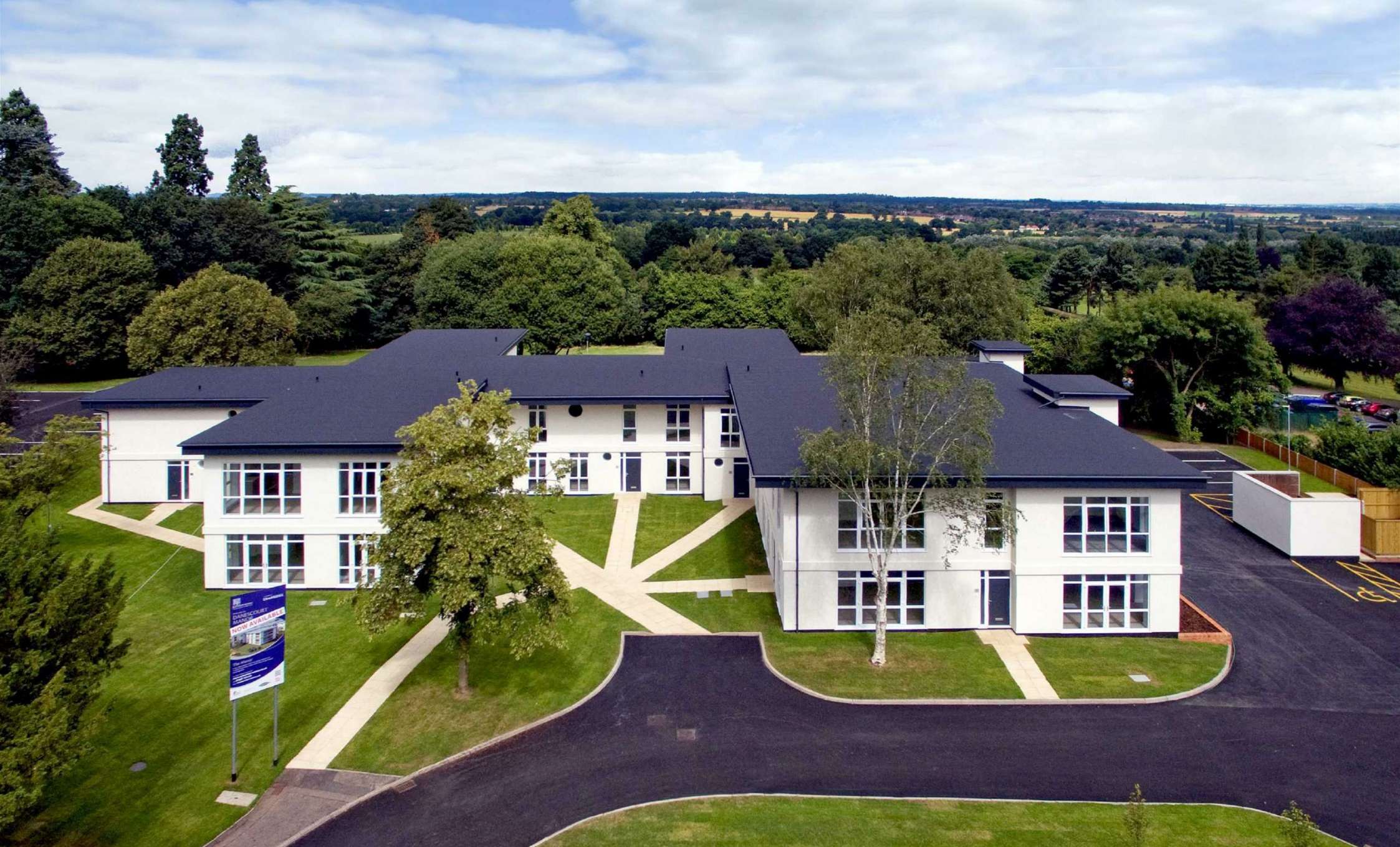
19 Danescourt Manor, Danescourt Road Tettenhall, Wolverhampton, West Mids, WV6 9BH