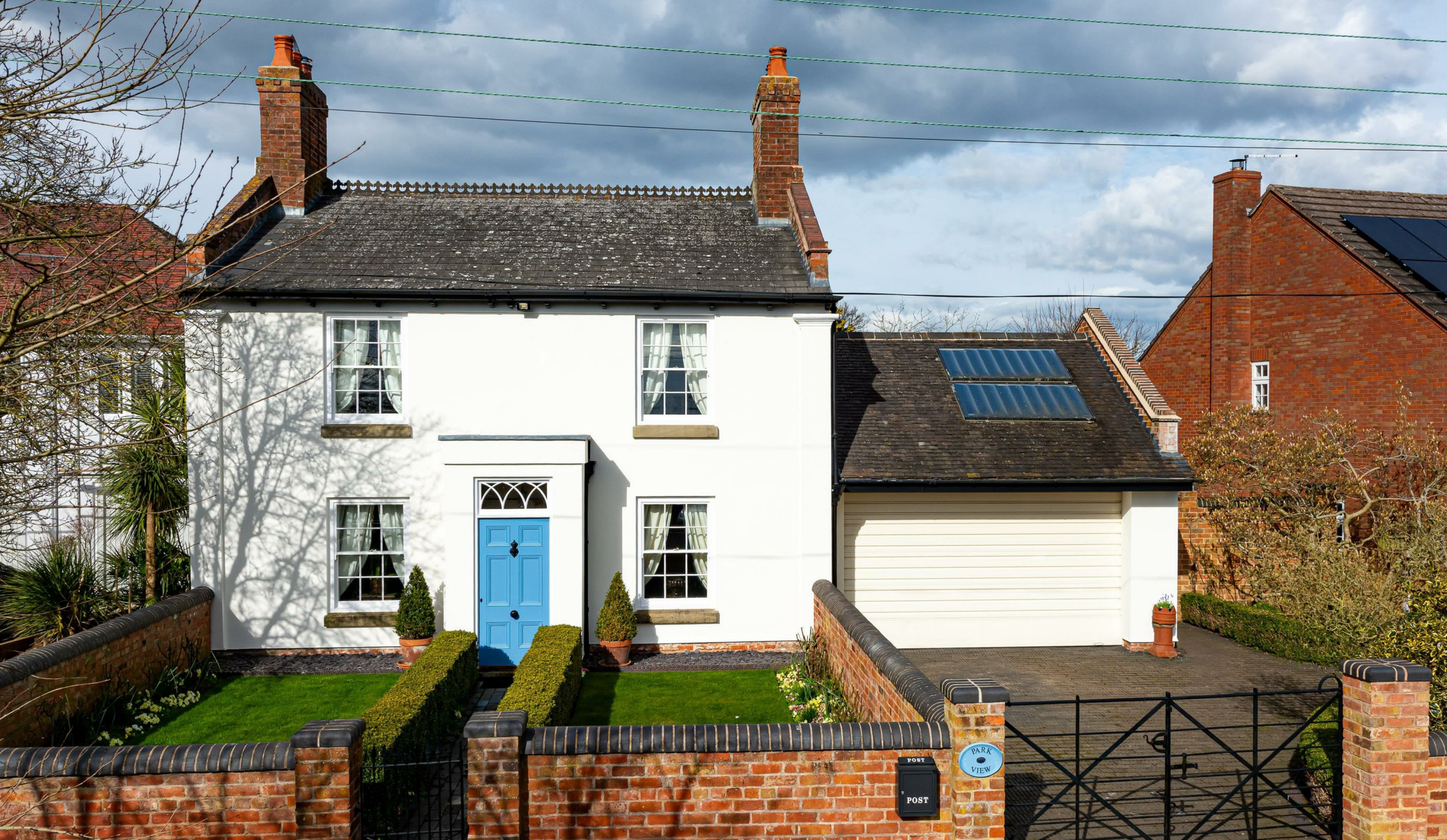
Park View, Park Lane, Lapley, Stafford, ST19 9JT